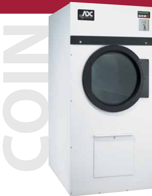
AD-50V Coin Dryer